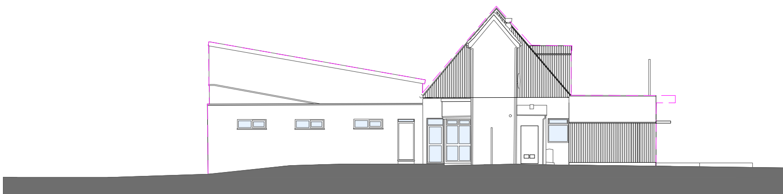
1 South West Elevation