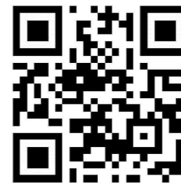
GOOGLE MAPS QR CODE

GOOGLE MAP - https://goo.gl/maps/ijX6RBxgdXp