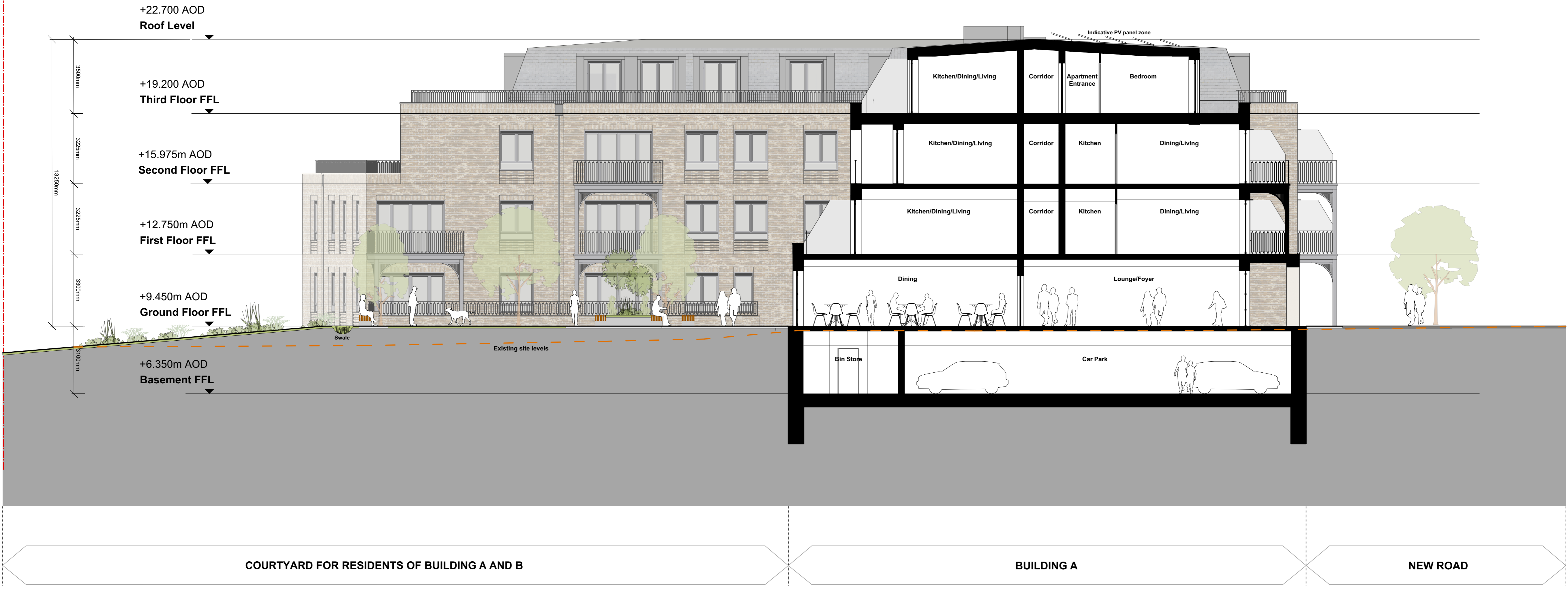
1 Building A Section AA Scale: 1:100

General notes This drawing must not be used for land transfer purposes. This drawing must be read in conjunction with all other relevant drawings, specification clauses and current design risk register. Areas are measured and calculated generally in accordance with the Nationally Described Space Standard and/or RICS Property Management, 2nd Edition (2018) and have been calculated in metric units. All setting out, dimensions and levels must be checked on site. Levels refer to Ordnance Datum Newlyn, unless stated otherwise. This drawing must not be used on site unless issued for construction. Refer to Information Plan for definition of drawing status.