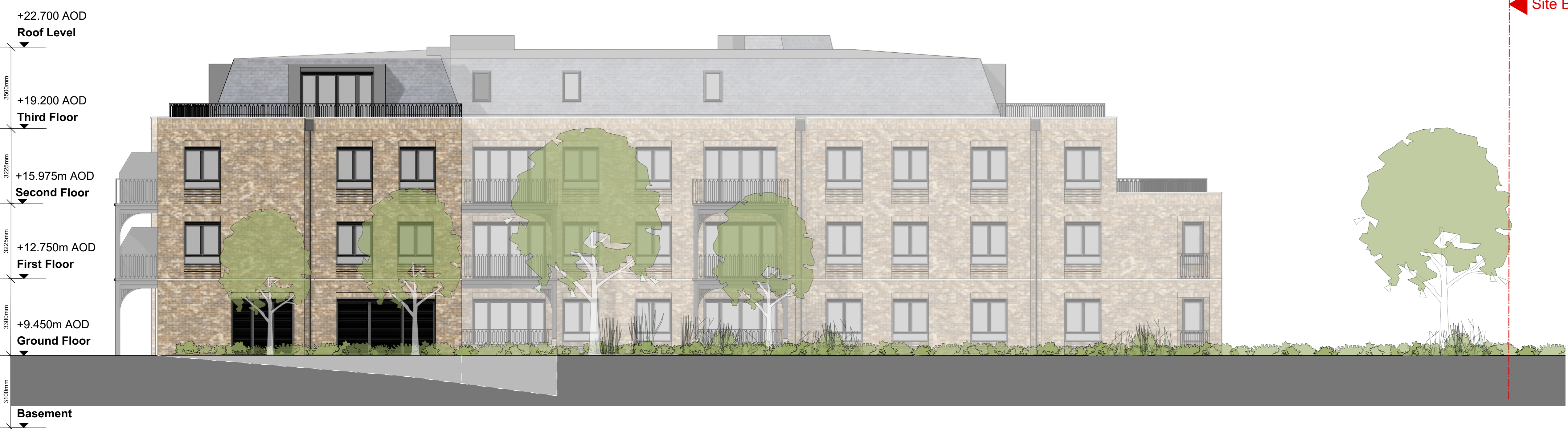
2 Elevation A2 East Elevation

Assael Architecture 123 Upper Richmond Road London SW15 2TL +44 (0)207 736 7744 info@assael.co.uk www.assael.co.uk