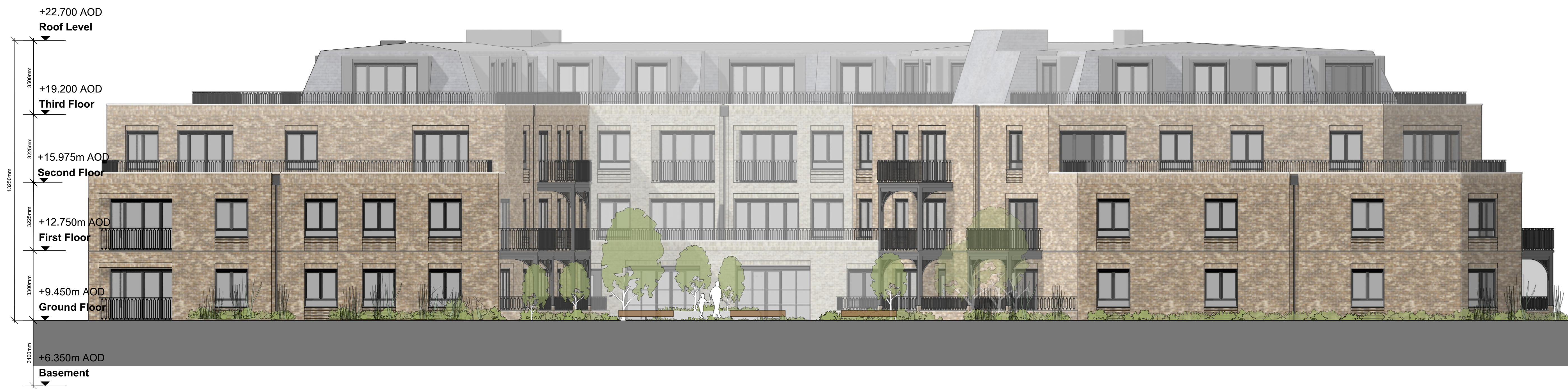
1 Elevation A1 North Elevation

General notes This drawing must not be used for land transfer purposes. This drawing must be read in conjunction with all other relevant drawings, specification clauses and current design risk register. Areas are measured and calculated generally in accordance with the Nationally Described Space Standard and/or RICS Property Management, 2nd Edition (2018) and have been calculated in metric units. All setting out, dimensions and levels must be checked on site. Levels refer to Ordnance Datum Newlyn, unless stated otherwise. This drawing must not be used on site unless issued for construction. Refer to Information Plan for definition of drawing status. Drawing revision prefix (not applied to sketches): P = Pre-Contract C = Contract © Assael group of companies 2022