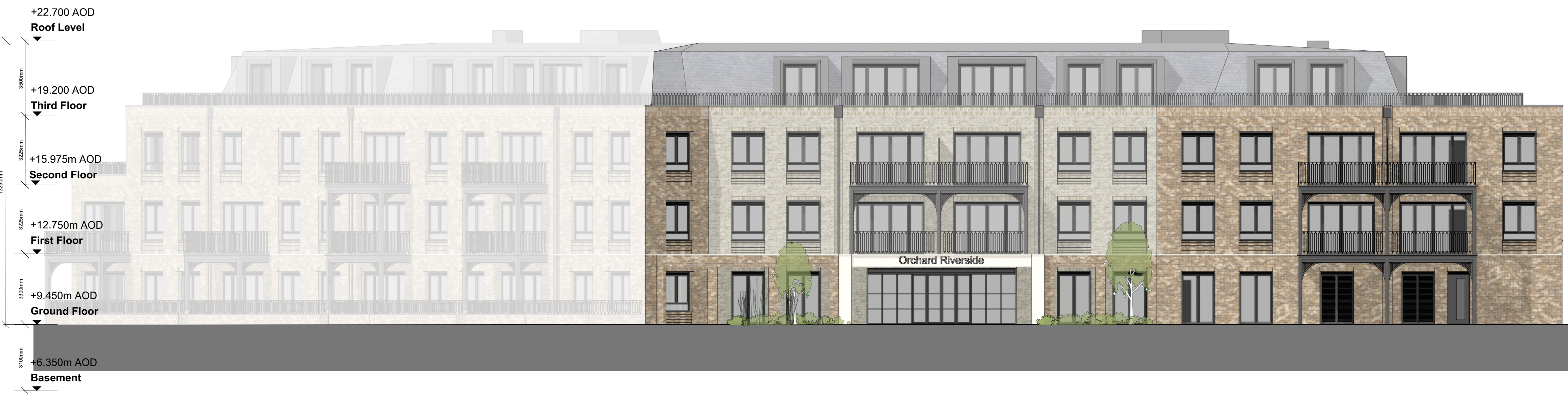
3 Elevation A3 South Elevation

Assael Architecture 123 Upper Richmond Road London SW15 2TL +44 (0)207 736 7744 info@assael.co.uk www.assael.co.uk