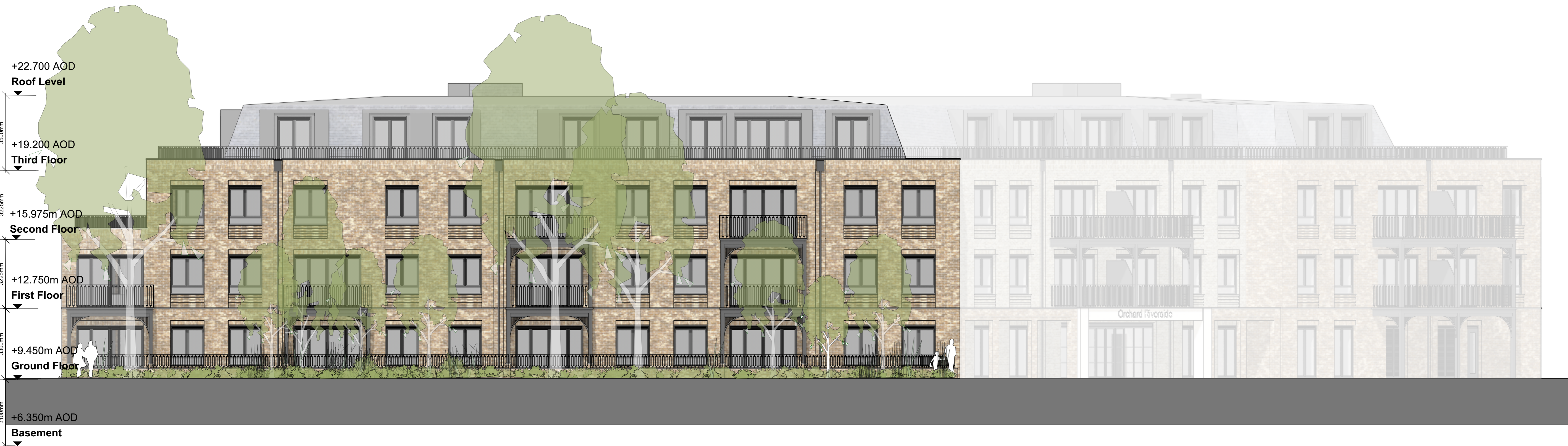
4 Elevation A4 West Elevation