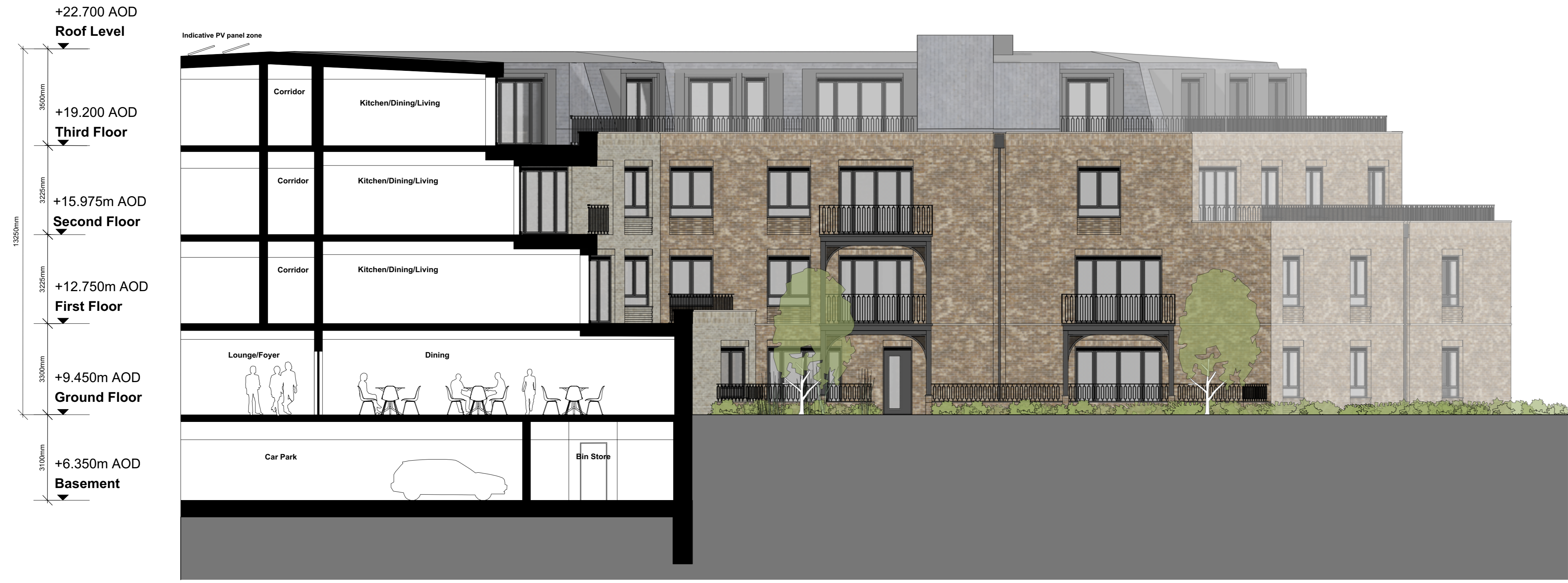
1 Elevation A5 East Elevation

Assael Architecture 123 Upper Richmond Road London SW15 2TL +44 (0)207 736 7744 info@assael.co.uk www.assael.co.uk