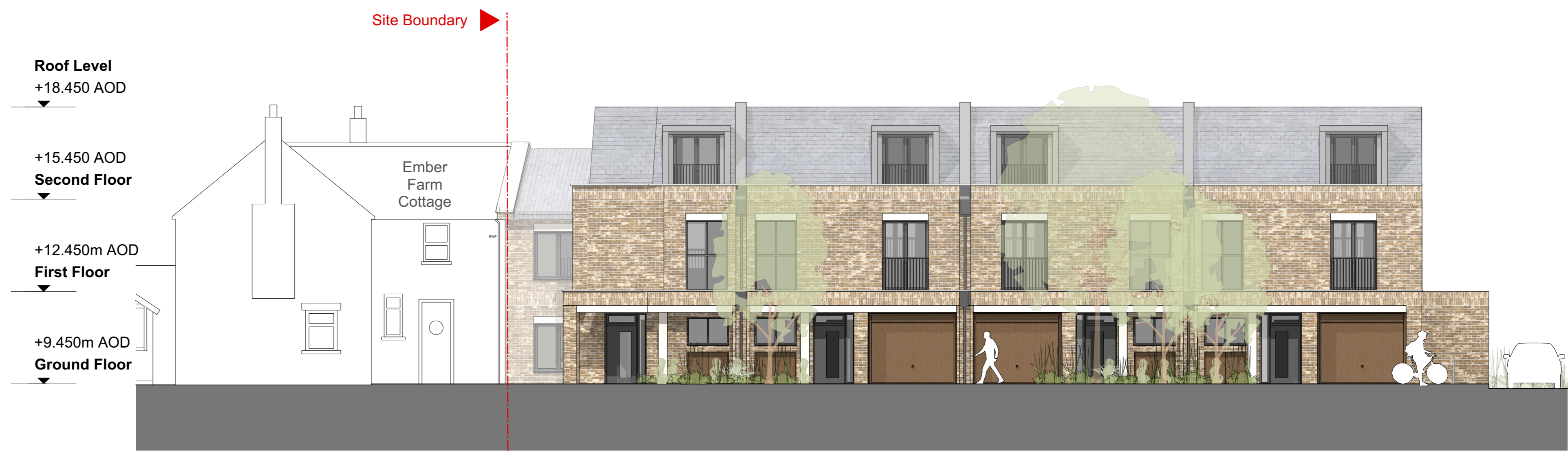
2 Elevation B2 East Elevation