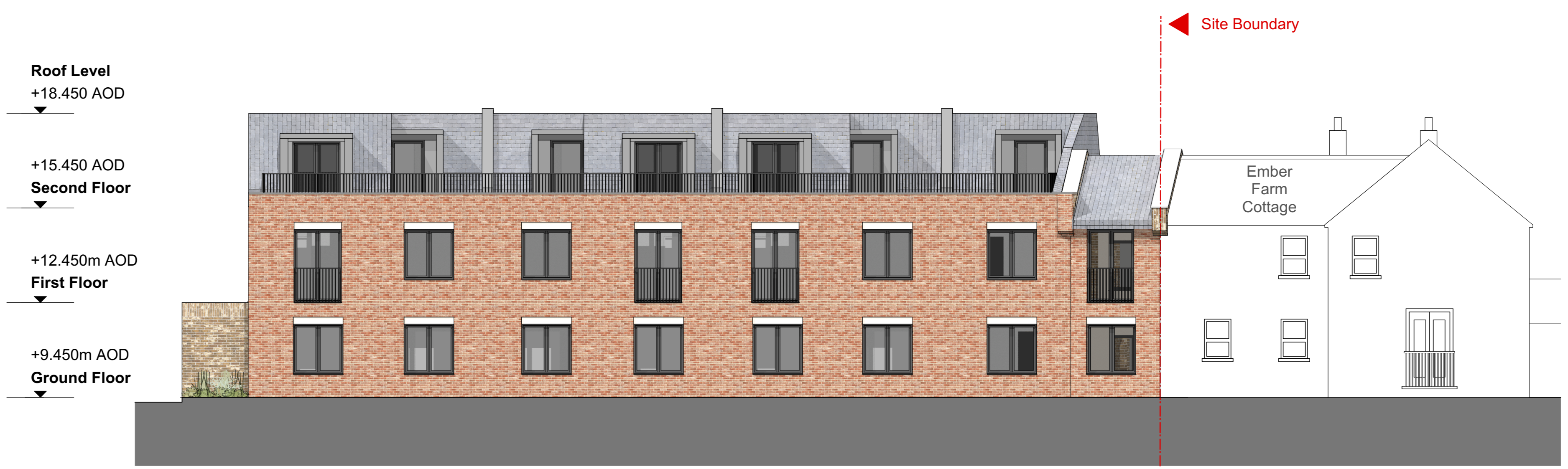
4 Elevation B4 West Elevation