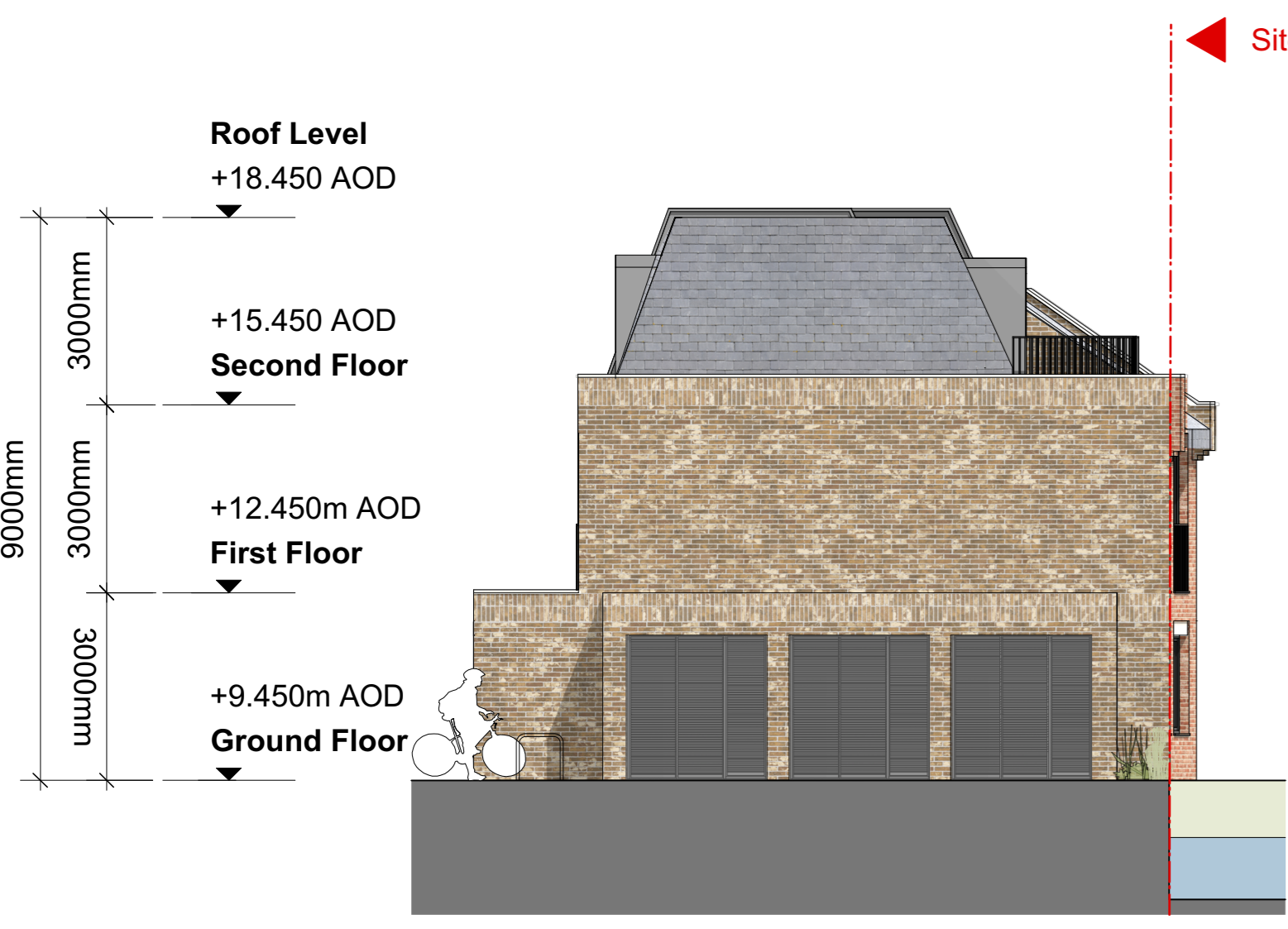
1 Elevation B1 North Elevation

Assael Architecture 123 Upper Richmond Road London SW15 2TL +44 (0)207 736 7744 info@assael.co.uk www.assael.co.uk