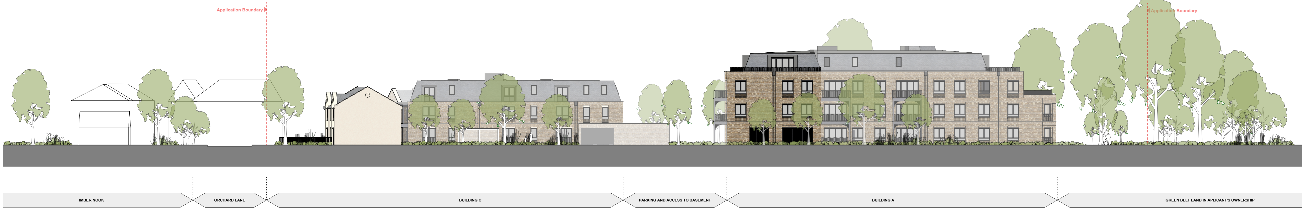
2 East Elevation Scale: 1:250