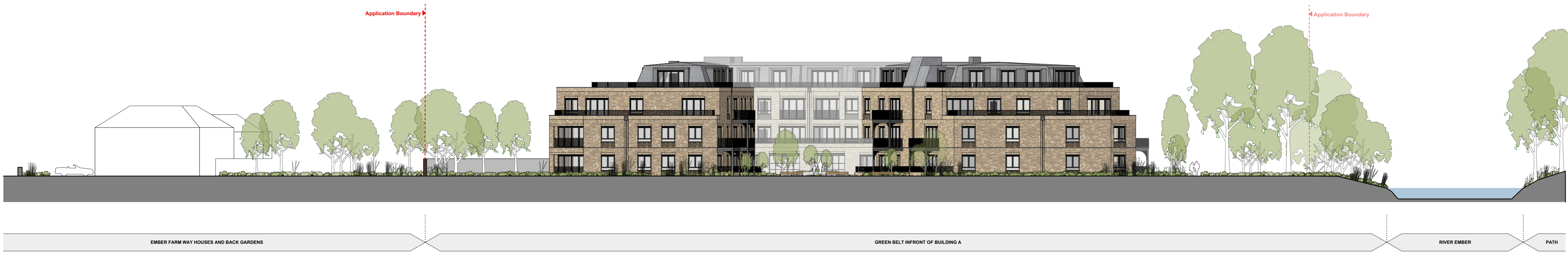
1 North Elevation Scale: 1:250