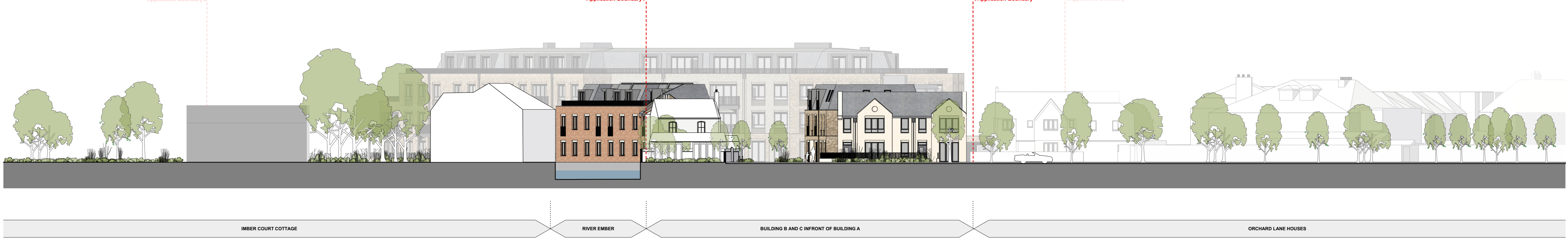
3 South Elevation Scale: 1:250