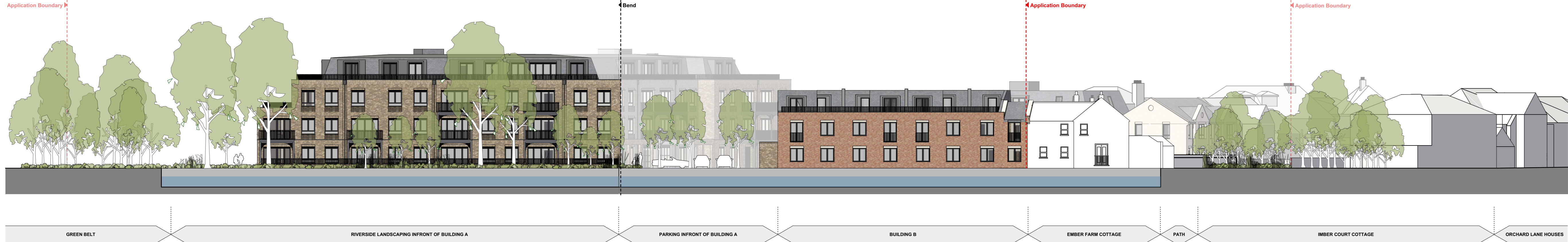
4 West Elevation Scale: 1:250