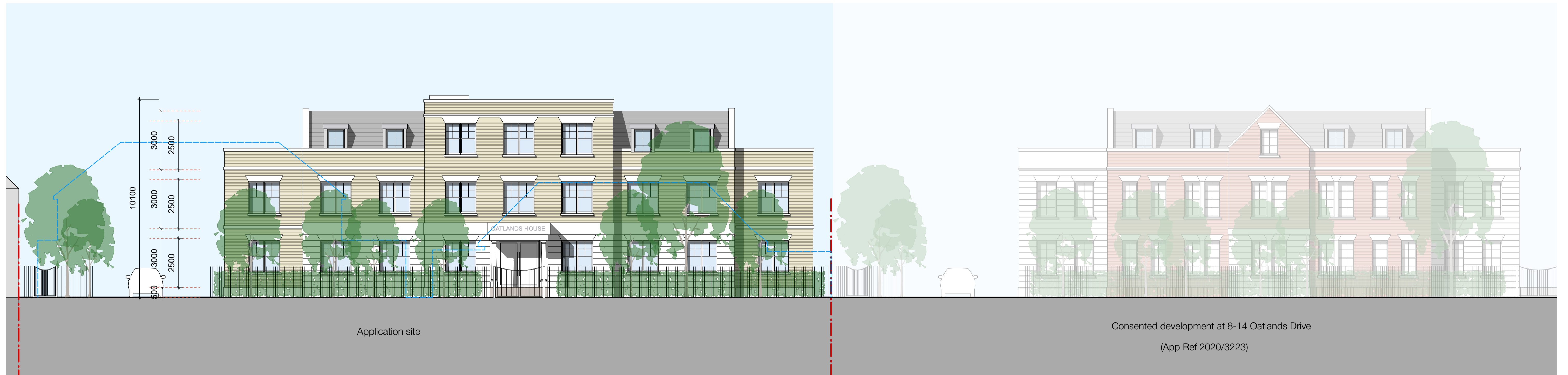
Elevation - Oatlands Drive streetscene