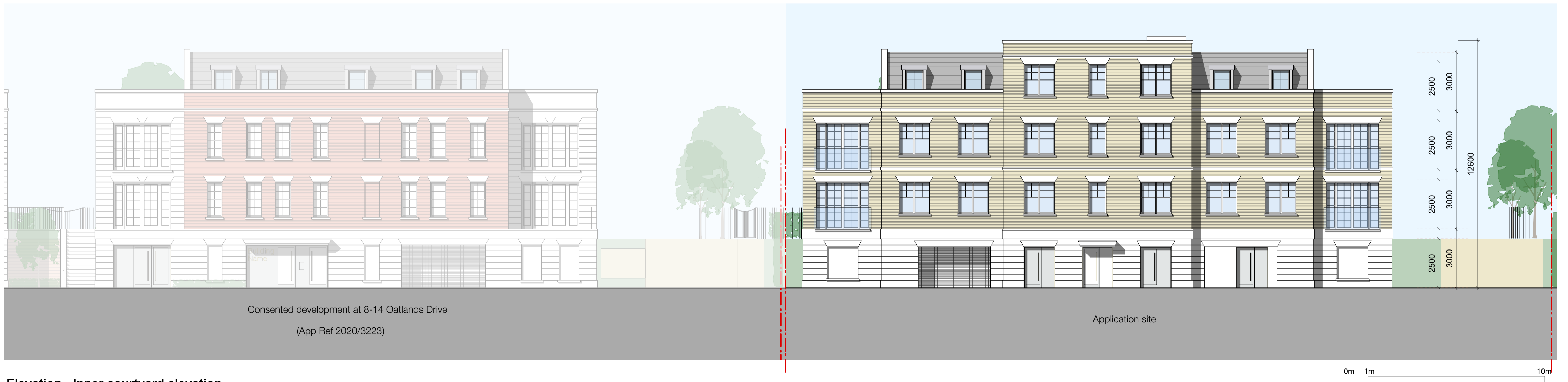
Elevation - Inner courtyard elevation