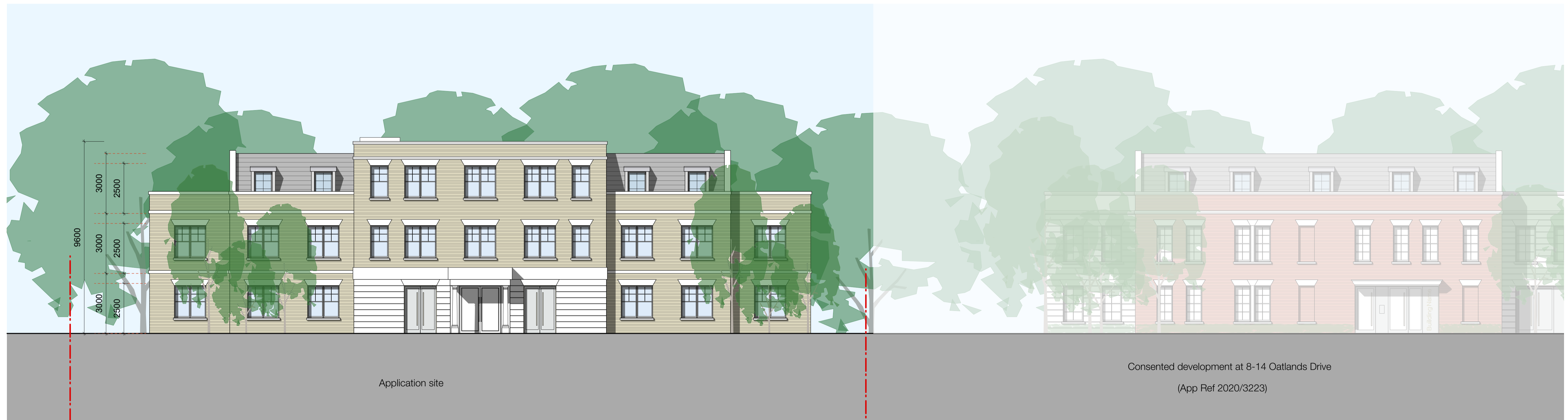
Elevation - Front elevation of Rear Building