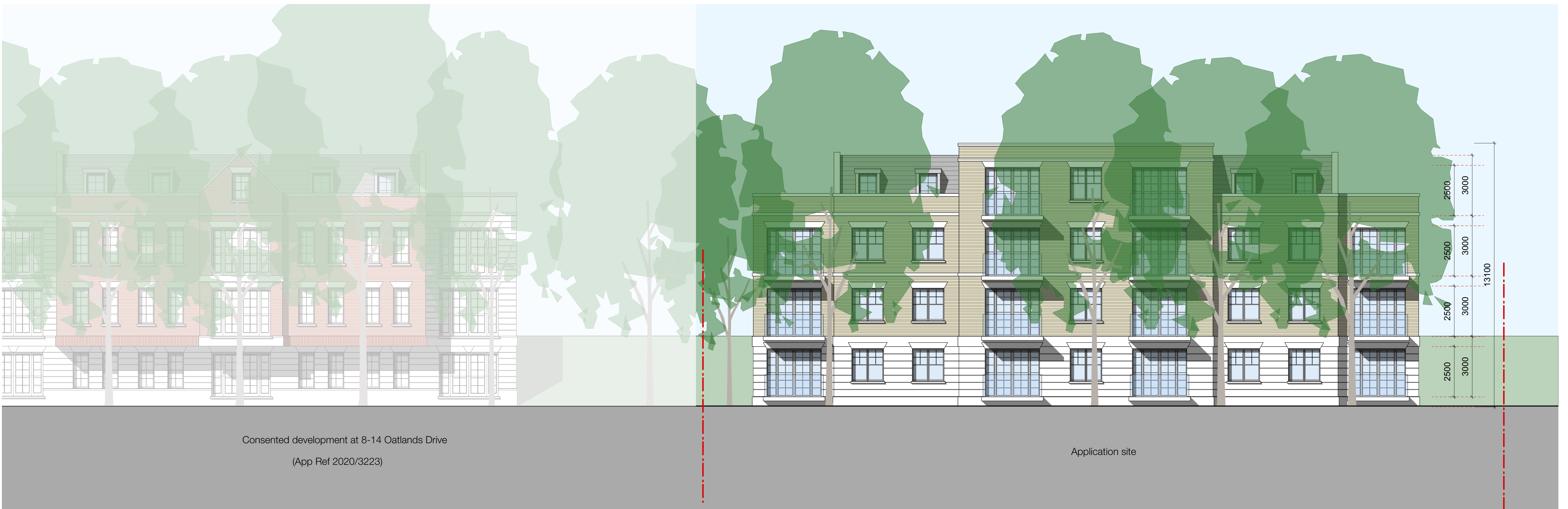
Elevation - Rear elevation of Rear Building