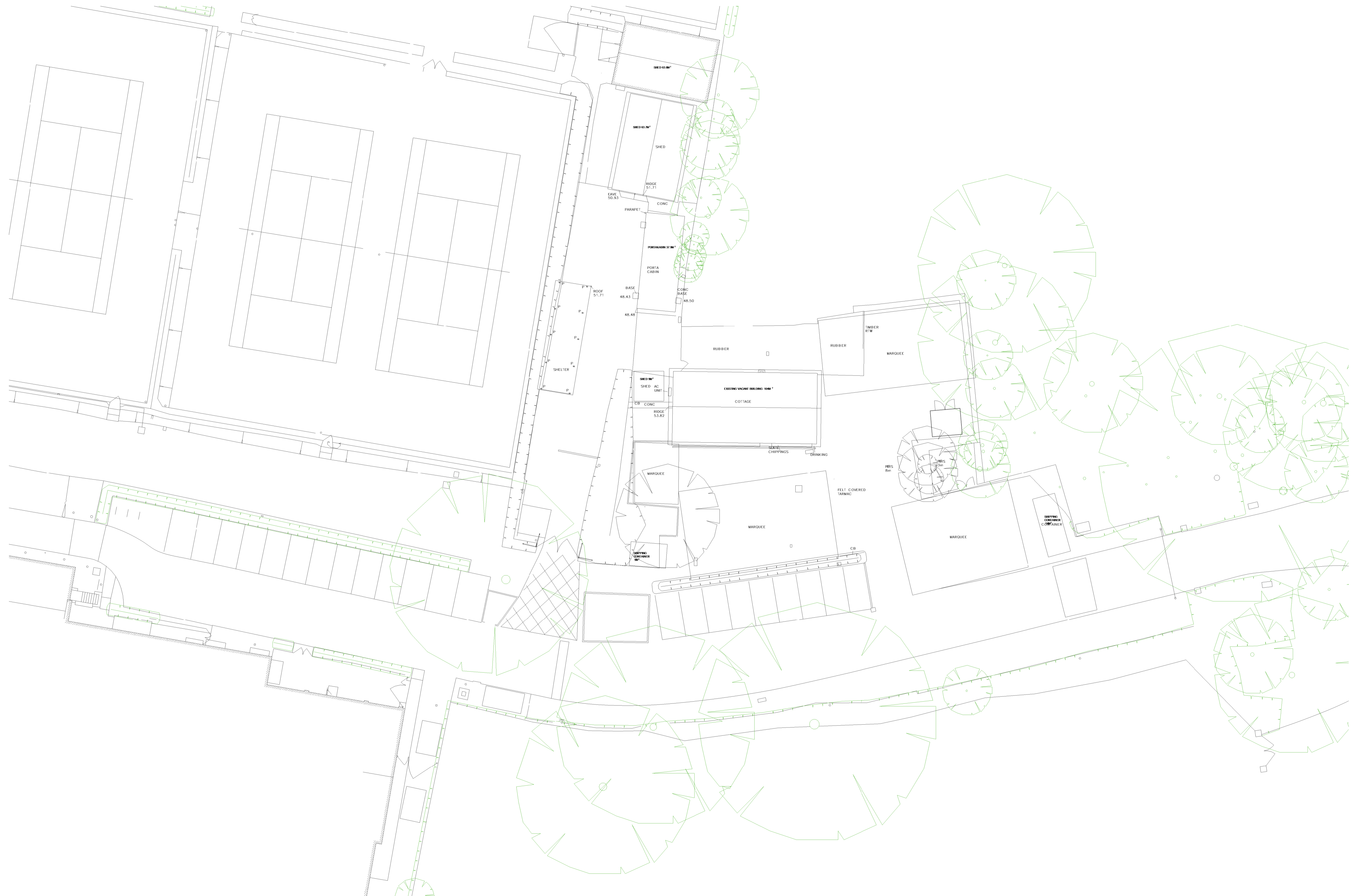
Existing Site Plan 1 : 200