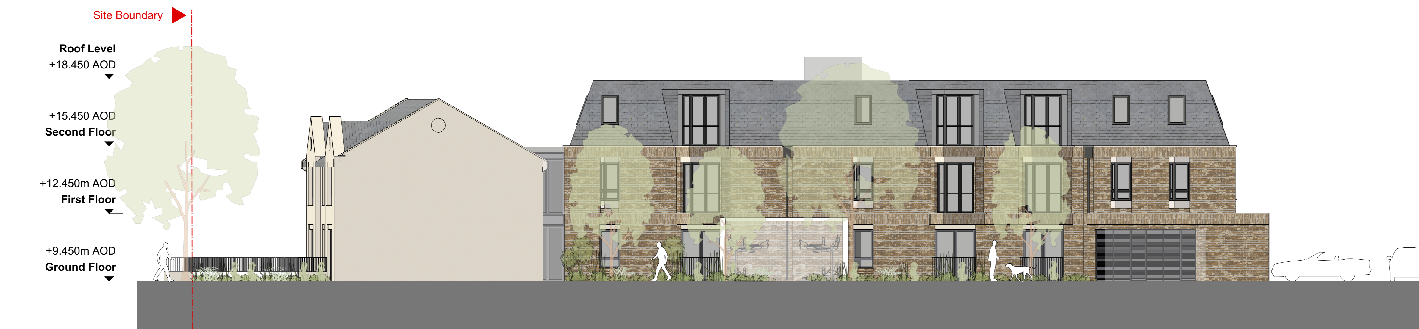
3 Elevation C3 East Elevation