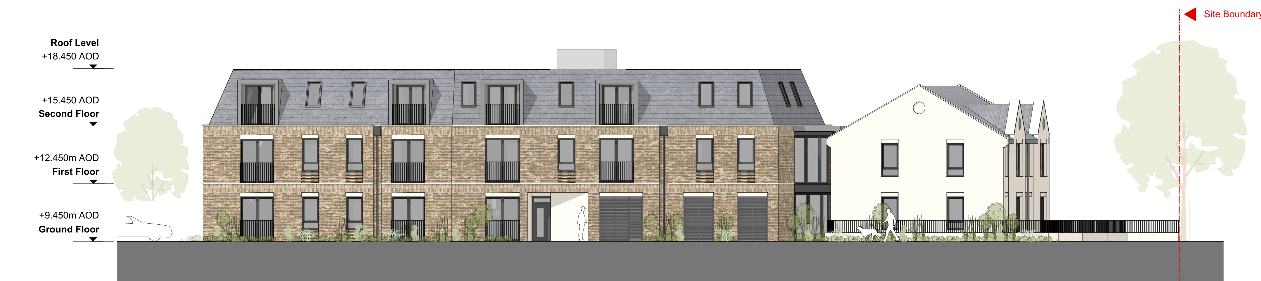
4 Elevation C4 West Elevation