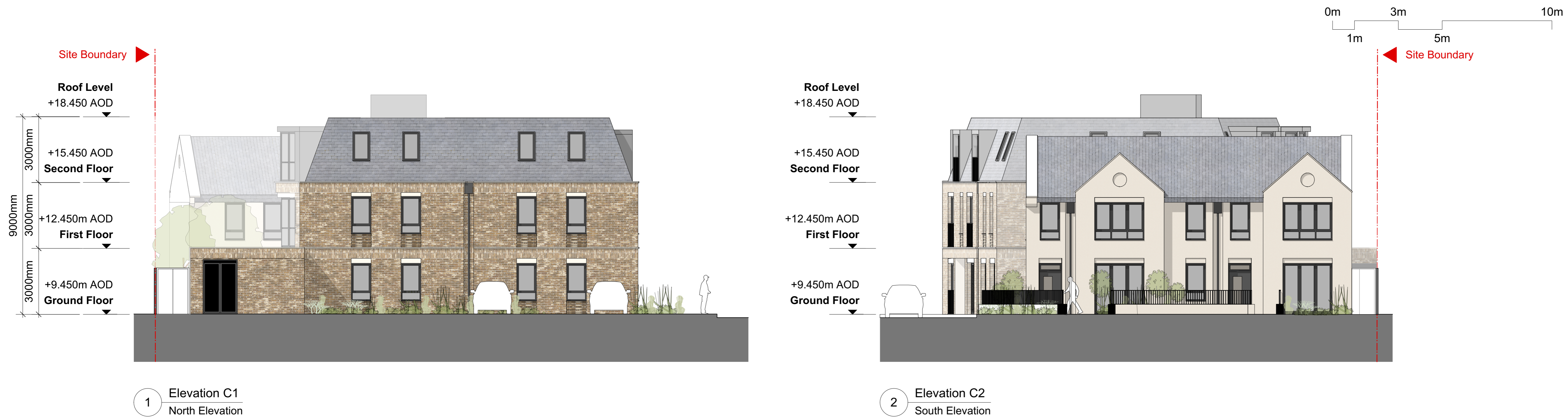
1 Elevation C1 North Elevation