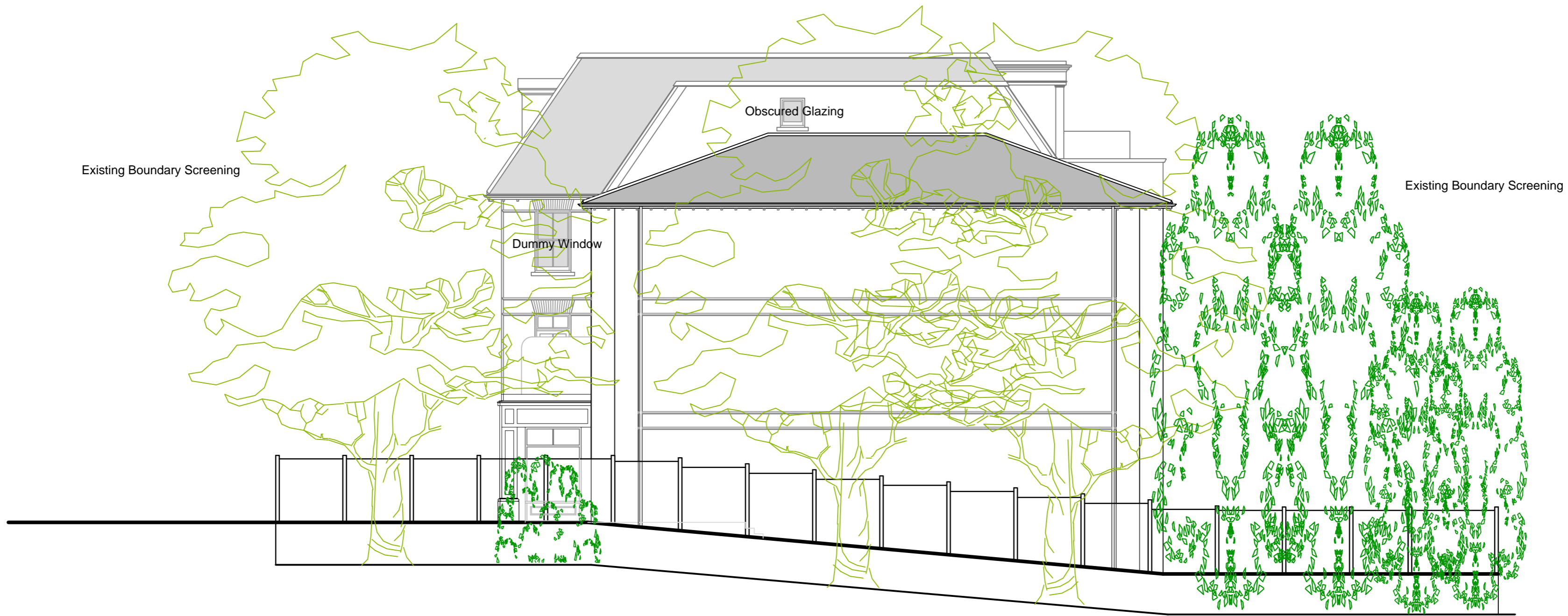
Side Elevation (North)