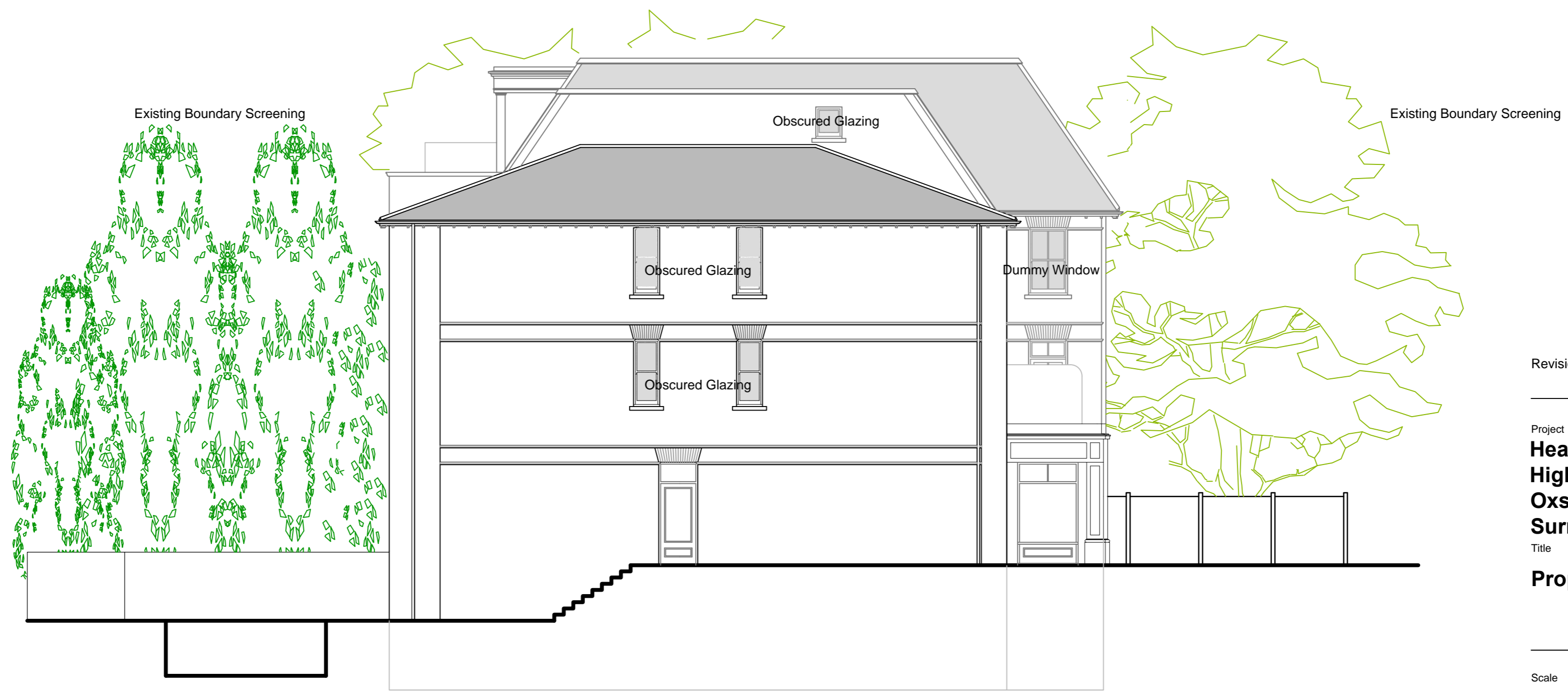
Side Elevation (South)