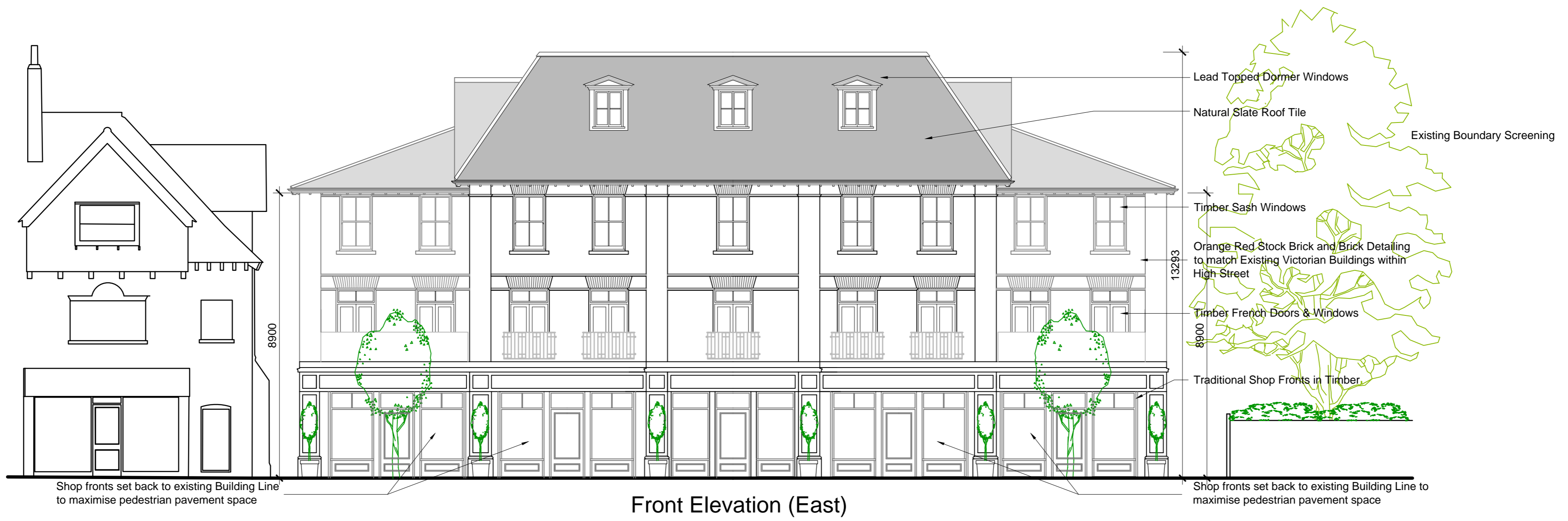
Front Elevation (East)